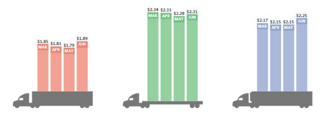
National Spot Rates: Van, Flatbed, Reefer